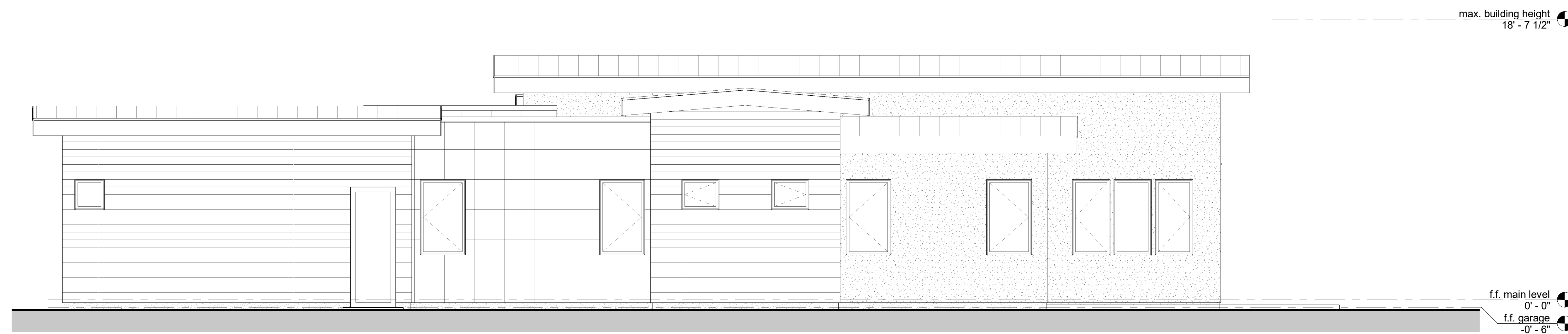
right elevation - base 1/4" = 1'-0"