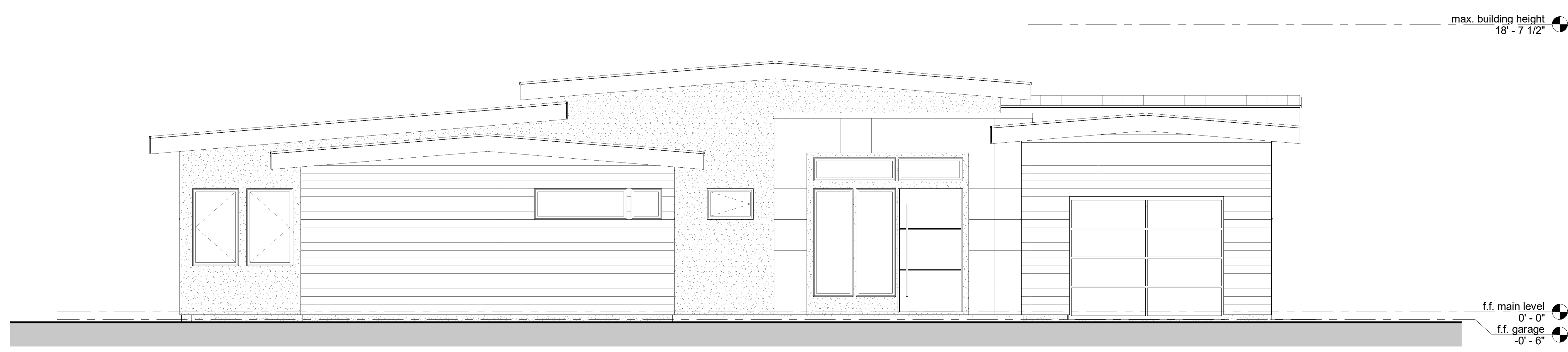
front elevation - base 1/4" = 1'-0"

architectural design group 4110 mill street, suite 205 reno, nevada 89502