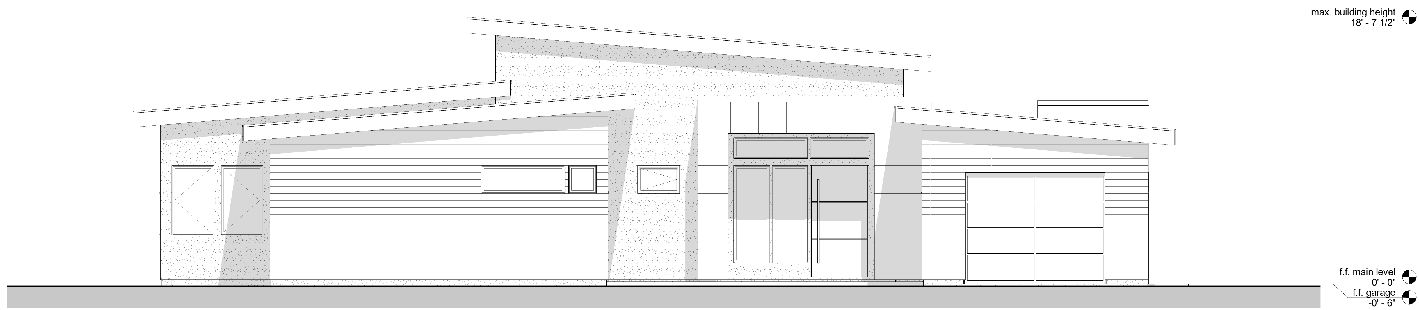
front elevation - base 1/4" = 1'-0"

Architectural design group 4110 mill street, suite 205 reno, nevada 89502 NOT FOR CONSTRUCTION